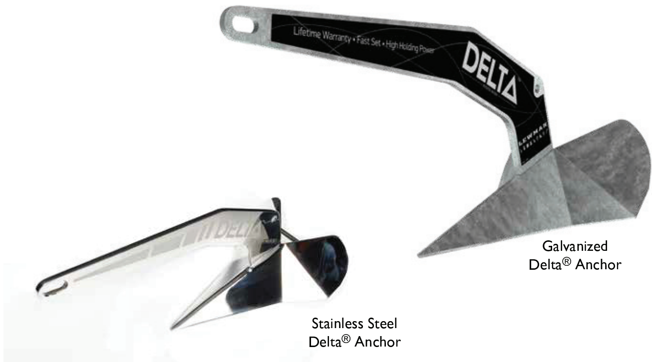
Galvanized Delta ® Anchor