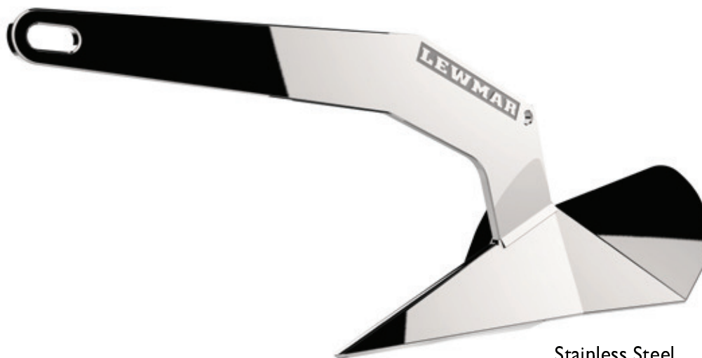
Stainless Steel DTX Anchor