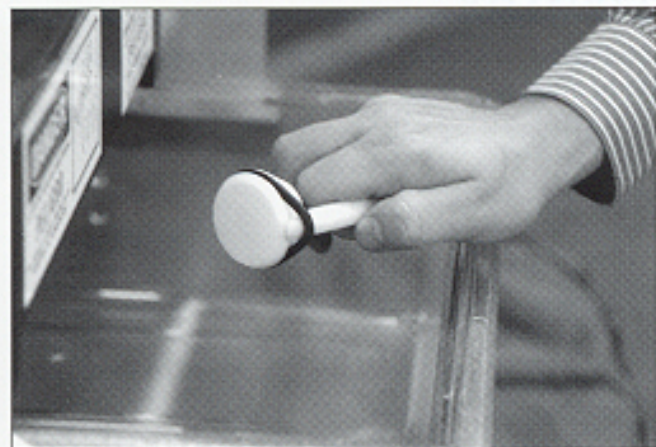
Catch tub and O ring removal tool supplied with depositor