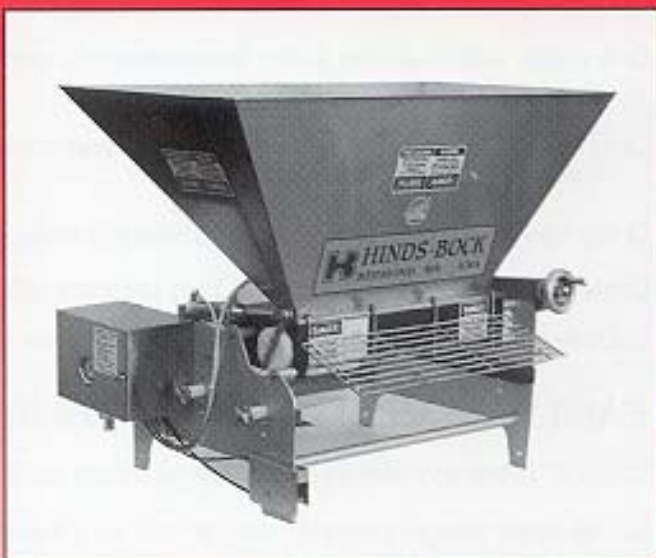
Shown here: 4P08NT Four-Piston Version

THESE SIMPLE-TO-OPERATE TABLETOP DEPOSITORS are the economical, maintenance-free workhorses of the smaller bakery. They can handle a wide variety of pan configurations such as muffin, cupcake, sheetcake and rounds with simple and fast changeover.