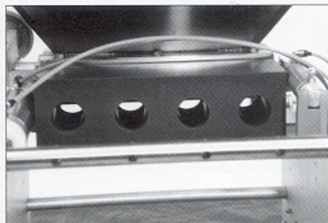
Backview with pistons removed