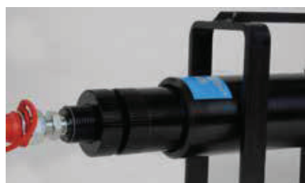
Mechanical end-stroke - maximum accuracy