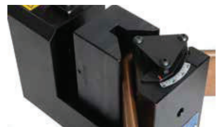
Integrated protractor indicator