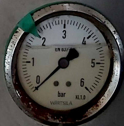
HT - WATER