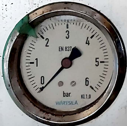
LT - WATER