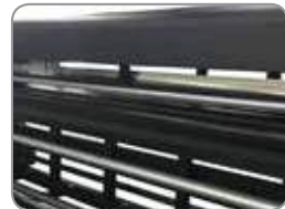
patented textile feeding system Allows an easy and a good run-ability printing on most woven fabrics used for back-lit, flag, banners, bedding and curtains.