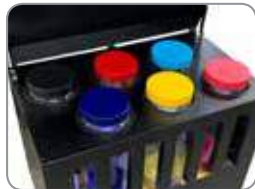
5kg/color continuous ink supply system Designed to be refilled with inks while printing. The level of ink is easy to check visually or by sensor. Is provided with a double filtering system able to protect the printer against any intrusive or harmful substances.