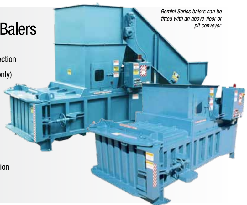
Gemini Series balers can be fitted with an above-floor or pit conveyor.