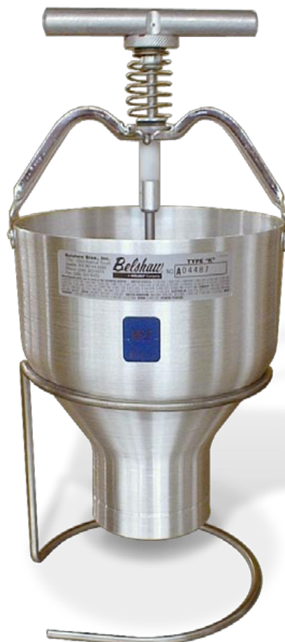
Type K Donut Dispenser with optional holder

The stainless steel Type K holder (Item #K-1016WSS) is simple, easy to clean, saves time, and helps keep your Type K safe from damage.