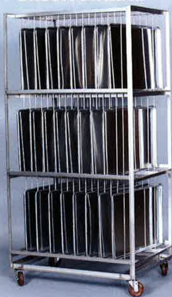
Sheet Pan Rack