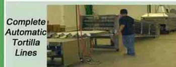
Complete Automatic Tortilla Lines