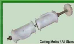
Cutting Molds / All Sizes

Tortilla Production Line Anywhere From 600 Pcs./Hr. to 60,000 Pcs./Hr.