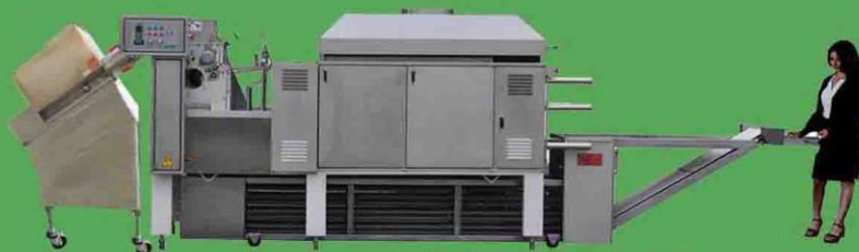
Over/Under Space Saving Oven Conveyor Configurations

Tortilla Production Line Anywhere From 600 Pcs./Hr. to 60,000 Pcs./Hr.