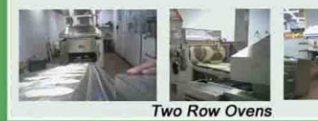
Two Row Ovens