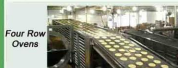
Four Row Ovens