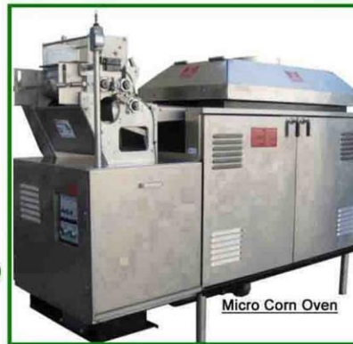
Micro Corn Oven