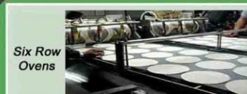
Six Row Ovens

(800)944-0396 or Main Office Toll Free or (562)949-0396