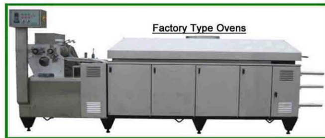
Factory Type Ovens