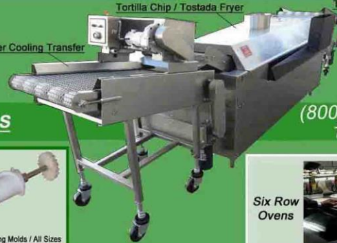
Tortilla Chip / Tostada Fryer