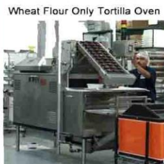
Wheat Flour Only Tortilla Oven