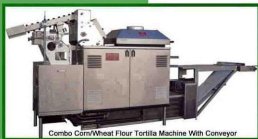
Combo Corn/Wheat Flour Tortilla Machine With Conveyor