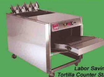
Labor Saving Tortilla Counter Stacker