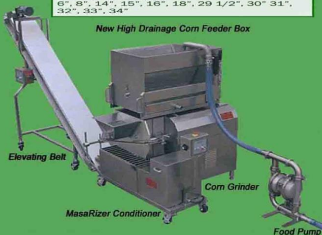
New High Drainage Corn Feeder Box

*Cutting Molds *Wire Mesh Belting 6", 8", 14", 15", 16", 18", 29 1/2", 30" 31", 32", 33", 34" *Oven Belts *Teflon Belts