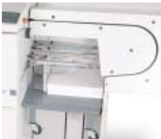
Unique turnover device keeps pre-collated work in perfect order, with Receding Stacker.