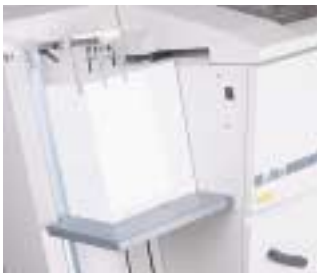
Top Feed Sheet Pickup with large capacity feeder of up to 14-1/2" pile.