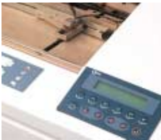
User-friendly Touch Key Controls maximize productivity.