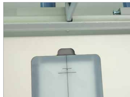
Registration marks for thicker and thinner materials offer you more versatility in applications.

Product information as of February 2009 and is subject to change without notice.