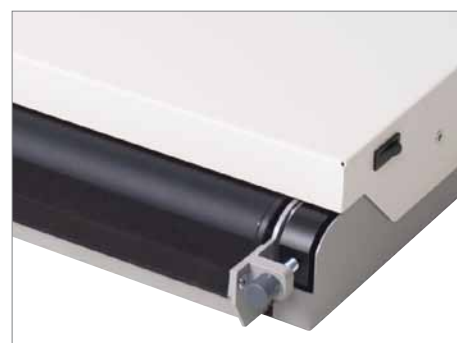
The integrated edge folding unit is adjustable for different cover board thicknesses.