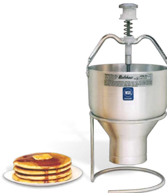
Below: Type K Pancake Dispenser with holder (Item #K-1016WSS)