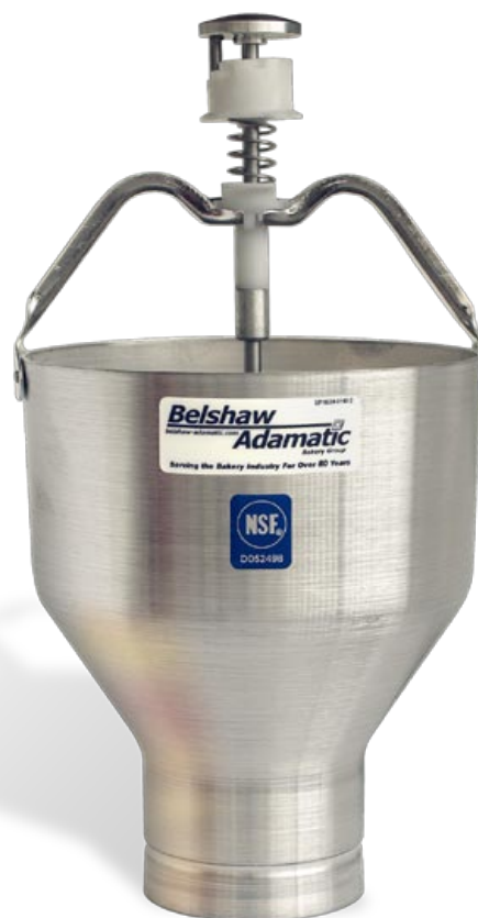
Above: Type K Pancake Dispenser (Item# 8504011)