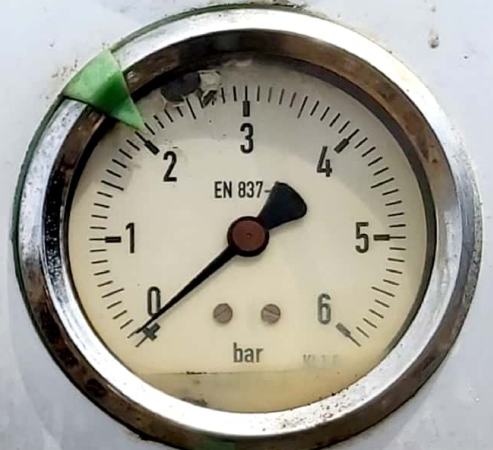
HT - WATER