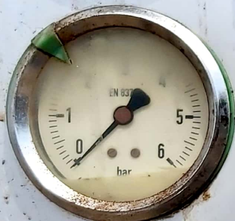
LT - WATER