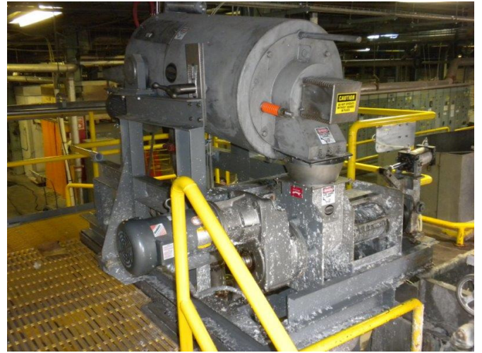
Fiber Filter as Pre-thickener to KP-10