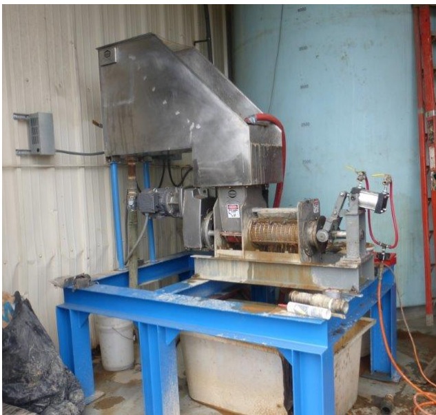
KP-6 Fed by Sidehill Screen