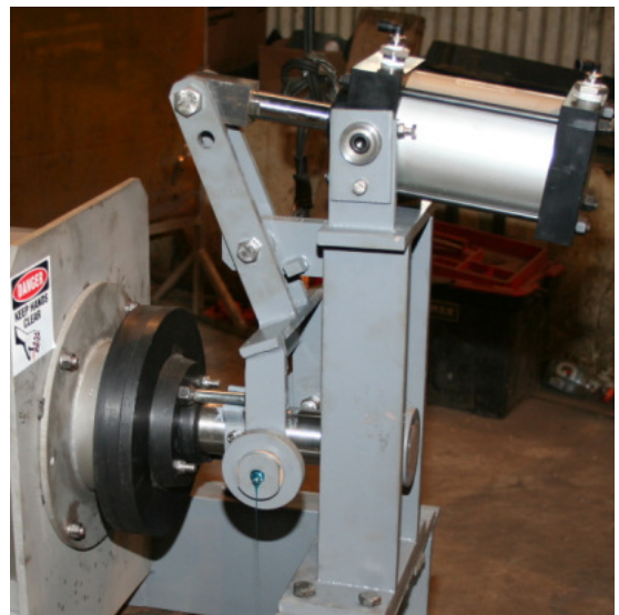
Air Cylinder Actuated Discharge Cone Controls Press Cake Moisture