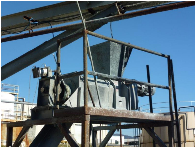
KP-10 at Plastics Recycler