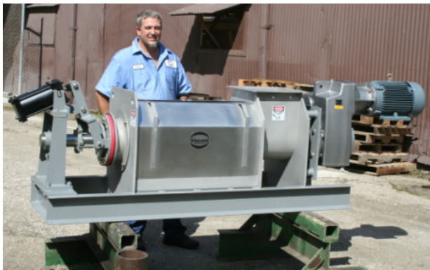
KP-10 Screw Press at Vincent