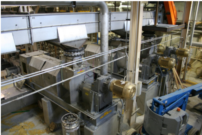
Trio of KP-24s on Corn Fiber