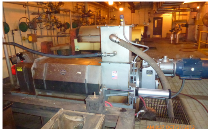
KP-16 with Level Sensor for Flow Control