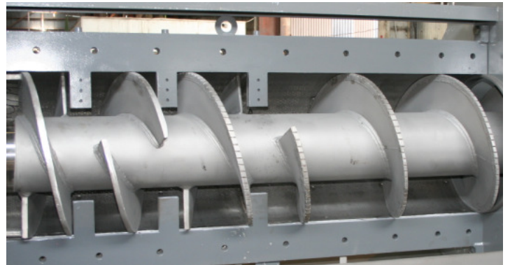
Interrupted Flighting, Graduated Pitch and Resistor Teeth for Maximum Dewatering