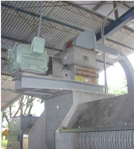
Shredder at Press Inlet