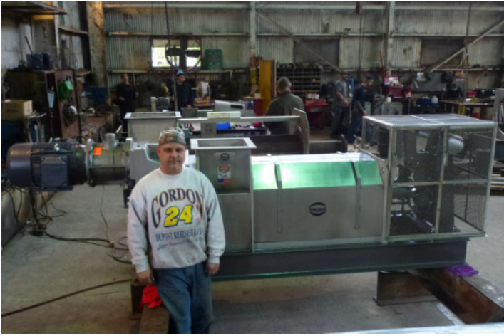
KP-12 with Safety Guarding