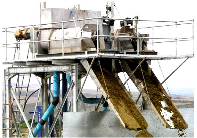
Dual KP-16s on Dairy Manure