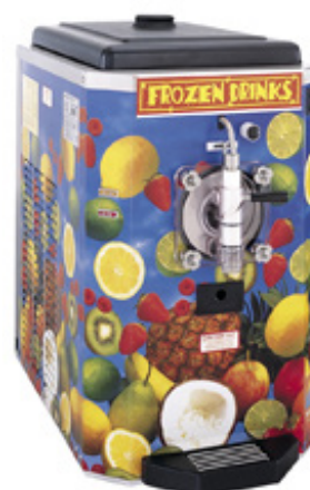
Shown with optional decals

A specially designed viscosity control automatically maintains superior product quality. An adjustable control allows the operator to serve a wide variety of frozen beverages at the desired thickness.