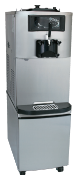
Optional cart with front opening door

Protects the operator from injury as the beater will not operate without the dispensing door in place.