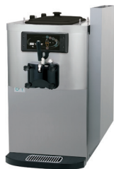
Optional top air discharge chute

750 N. Blackhawk Blvd. Rockton, Illinois 61072 800-255-0626 Phone 815-624-8333 Fax 815-624-8000 www.taylor-company.com info@taylor-company.com