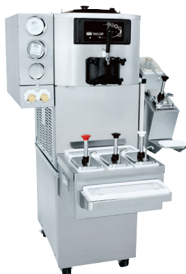
Optional cart with rear door for front mount syrup rail