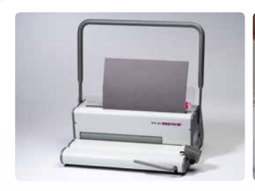
Vertical punching makes it quick and easy to punch correctly every time.