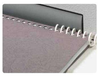
The simple to use rubber roller threads the coil through the document quickly and effectively.