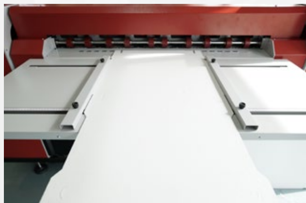
• Linear media guides.