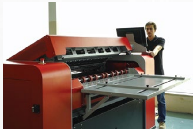
• Automatic lift for easy access & maintenance.