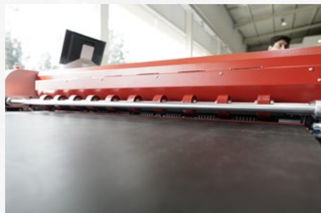
• Wide belt for perfect media transport.