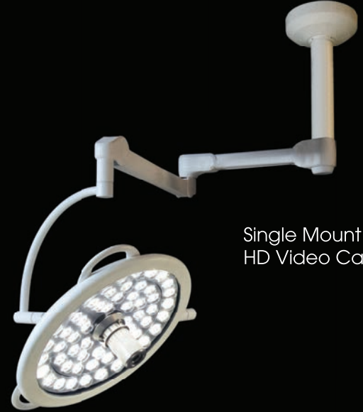
Single Mount with HD Video Camera