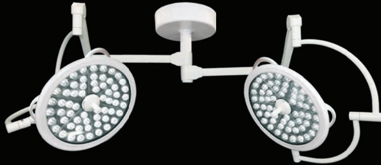
Dual Mount with Two Light Heads