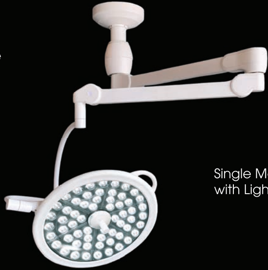
Single Mount with Light Head

Three lighting configurations and limitless possibilities. The VistOR MS comes in single, dual and triple mounts with one, two or three light or accessory options. Choose the best configuration to fit your operating rooms.