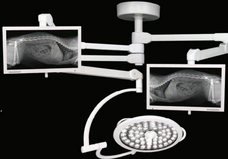
Triple Mount with One Light Head and Two Monitor Arms