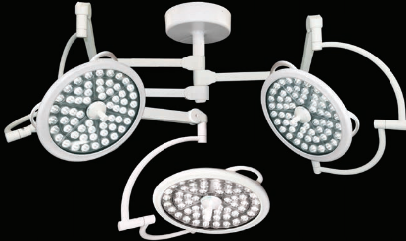
Triple Mount with Three Light Heads

The Triple Mount represents the ultimate flexibility in the surgery room. Configurations include three light heads, two light heads with video monitor arm, or video camera with two light heads. Complete surgery lighting and video capability with superb performance.