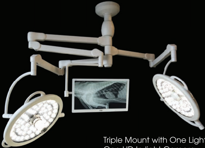
Triple Mount with One Light Head, One HD In-light Camera, and One Monitor Arm