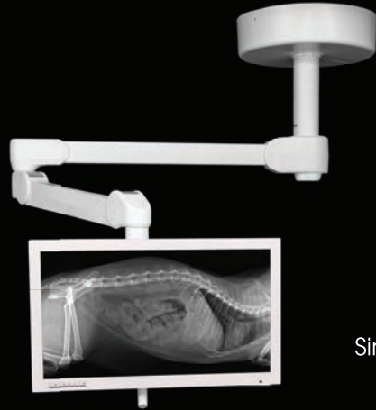
Single Mount with Monitor Arm

The single-light mounting system offers unsurpassed flexibility, exceptional illumination, and outstanding shadow control – even with just a single light head. This mounting can also support the high-definition video camera or monitor arm.