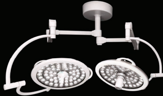
Dual Mount with One HD Video Camera and One Light Head