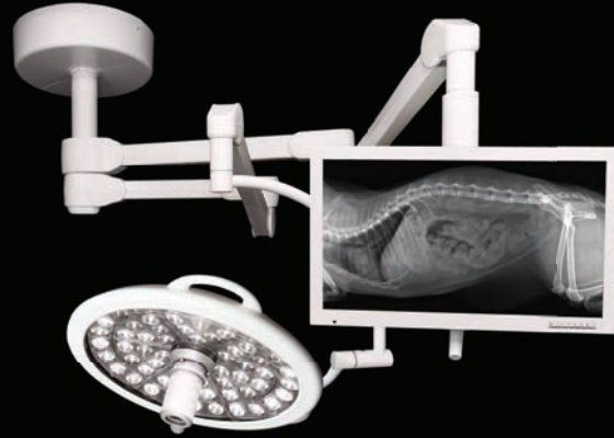
Dual Mount with One Light Head and One Monitor Arm

Providing dual lights for superior shadow control and intensity, or the option of one light and one video component (monitor or video camera). Without a doubt, an unparalleled value in the surgery market today.