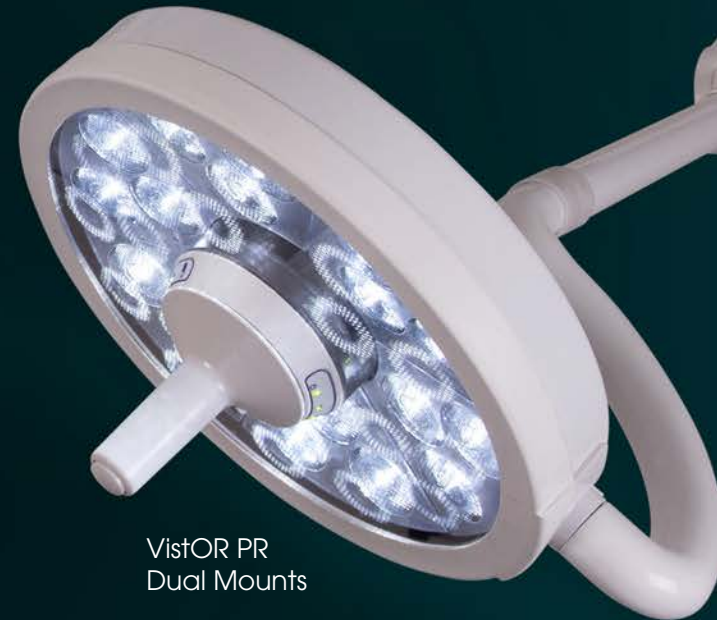
VistOR PR Dual Mounts