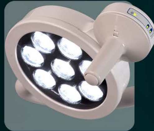
With Sterilizable Handle and Control Grip