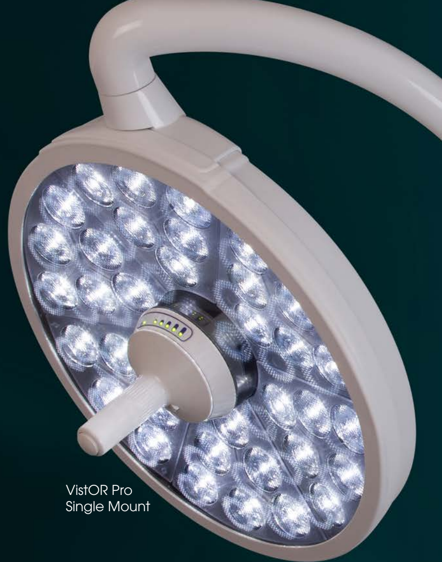
VistOR Pro Single Mount