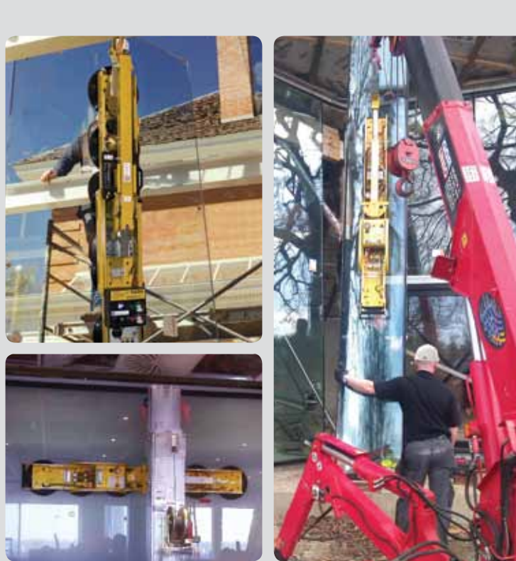
Glassmax 500 (page 140) with short hook MRTA611