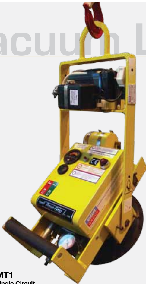
MT1 Single Circuit