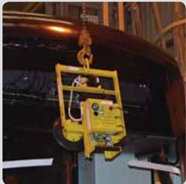
MT2 with a Glassboy 330 - see page 143 for further information