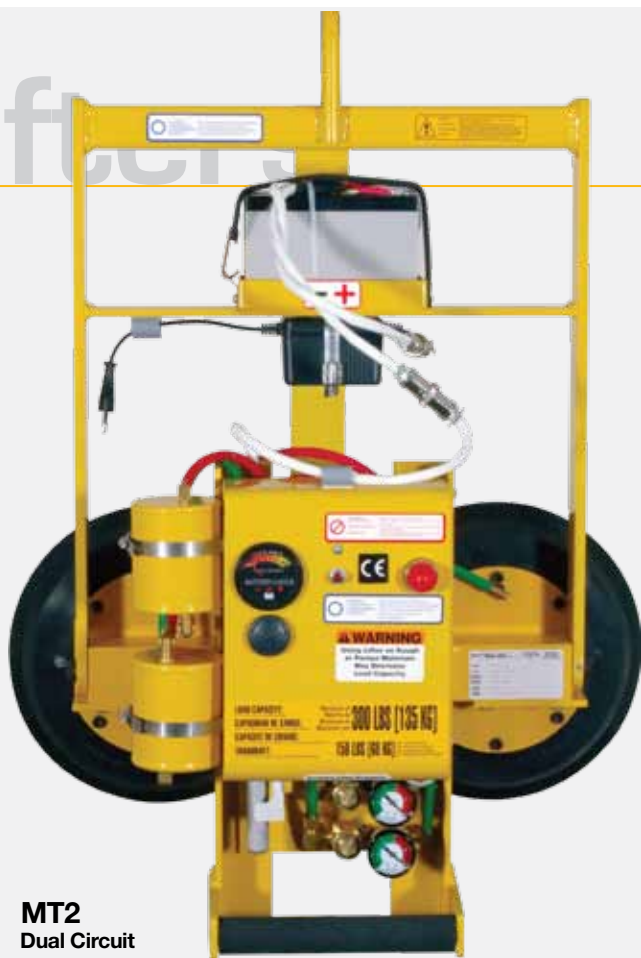
MT2 Dual Circuit