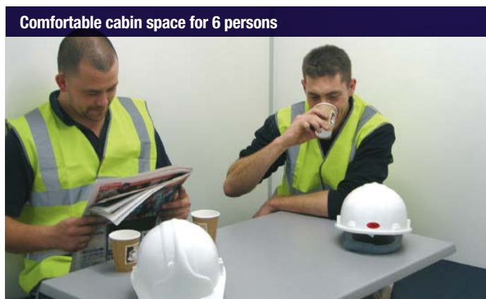
Comfortable cabin space for 6 persons