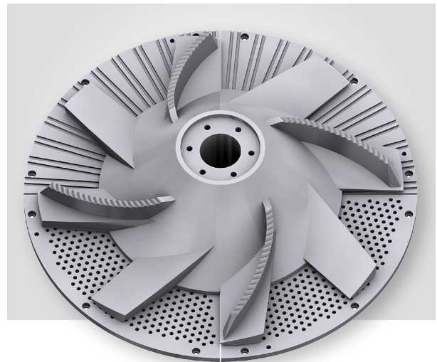
Saw-tooth rotor with 180° screen plate.