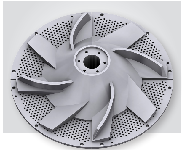
Rotor with standard 360° screen plate.