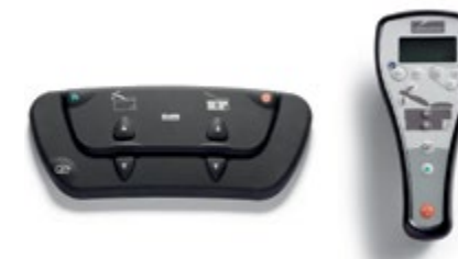
Wireless Controls Locate the hand and foot control anywhere in the room, removing cords and eliminating obstacles.