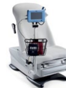
IQvitals® Table Mount Convenient table mount for the Midmark IQvitals vital signs device, designed to fit all Midmark and Ritter exam chairs.