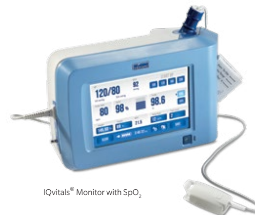
IQvitals® Monitor with SpO 2