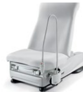
Ritter 253 LED Light The 253 is designed with easy access controls, high intensity light and an adjustable focal spot. Available in table mount and mobile options.