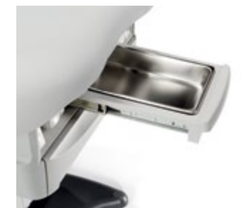
Stainless Steel Treatment Pan Ideal for lower-body procedures or other situations in which removal of fluid and debris is necessary.