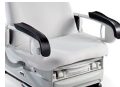
Patient Support Rails Plus™ Helps achieve proper positioning of the patient's arm for blood pressure capture.