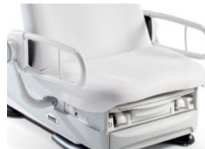
Patient Support Rails™ Provides patients with a 1¼ inch diameter continuous gripping surface for entering, exiting or repositioning on the exam table.