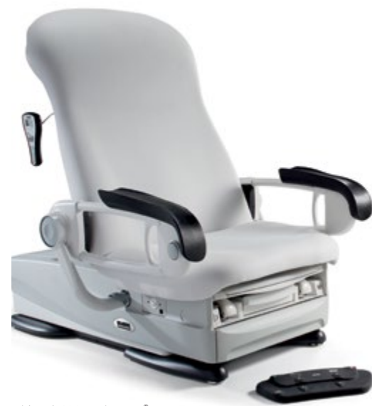
Midmark 626 Barrier-Free® Examination Chair