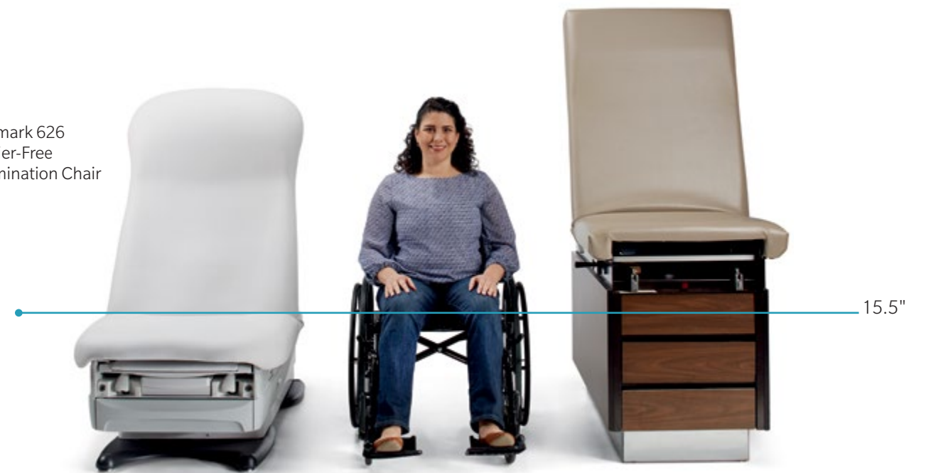
Midmark 626 Barrier-Free Examination Chair

One key factor impacting accessible design in the exam space is the examination chair. The federal agency providing leadership and guidance for accessible design, the U.S. Access Board, recommends an exam chair with a low, uncompressed seat height of 17" to 19". Midmark Barrier-Free® exam chairs are the only chairs on the market that can lower to a height of 15.5" (uncompressed upholstery).