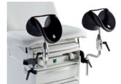
Articulating Knee Crutches The unique ball-socket design allows for a maximum range of adjustment, designed to ensure optimum knee and leg support. Available in a non-articulating option.