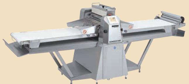
Rondostar 4000 SFI