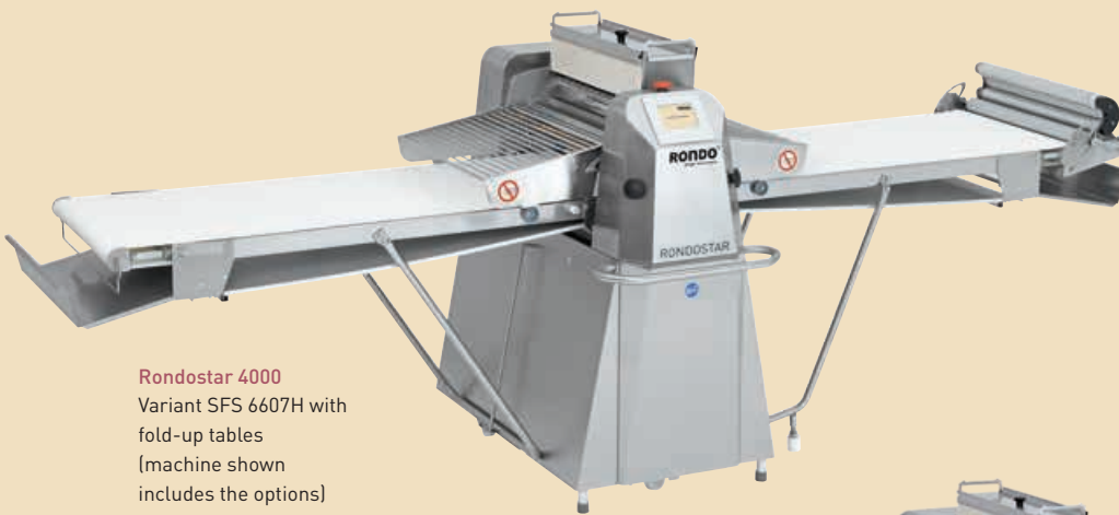
Rondostar 4000 Variant SFS 6607H with fold-up tables (machine shown includes the options)

Rondostar 4000 stands out for its sturdy, stainless steel construction, the use of high-quality components and simple operation. In addition to a long service life, it stands out for its high safety standard and modern, hygienic design.