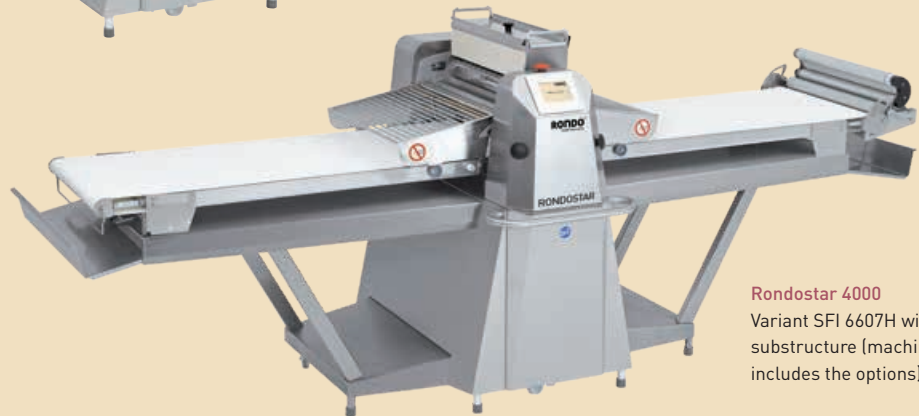
Rondostar 4000 Variant SFI 6607H with rigid substructure (machine shown includes the options)