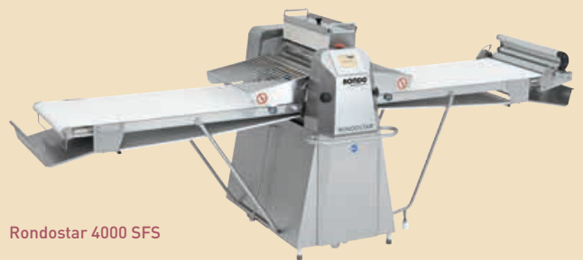
Rondostar 4000 SFS