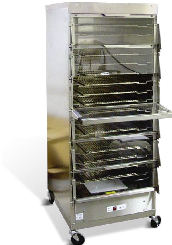
Belshaw TZ-17 Thermolizer