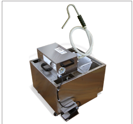
SF24 Shortening Filter