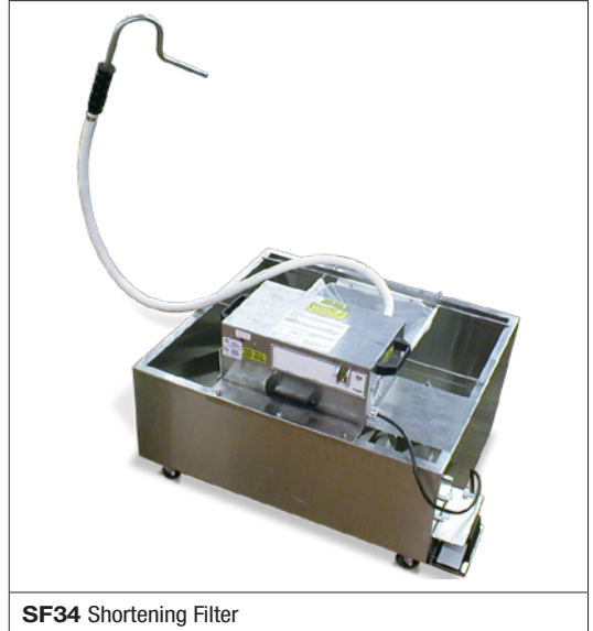
SF34 Shortening Filter