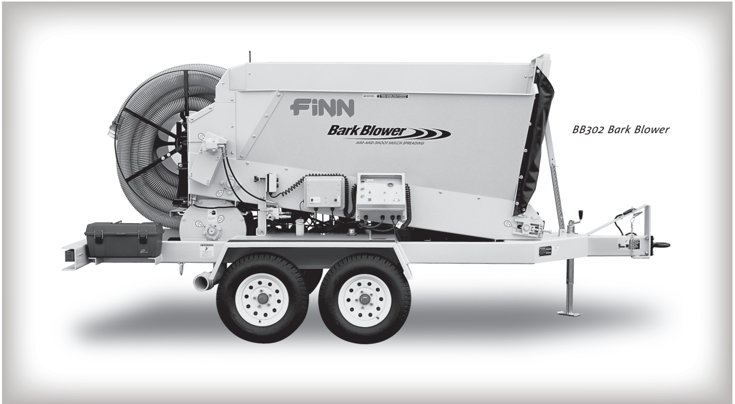
BB302 Bark Blower

The FINN BB302 Bark Blower applies landscape mulch and other bulk materials with unprecedented efficiency, and eliminates the need for labor-intensive hand application. The 1.5 cubic yard hopper is perfect for smaller jobs and hard to reach areas.