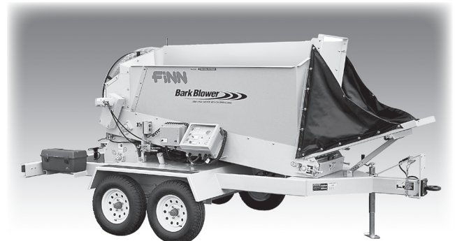
BB302 Bark Blower

As the world leader for over 70 years in the design and manufacture of innovative, quality equipment for the erosion control industry, FINN Corporation is committed to your complete satisfaction.