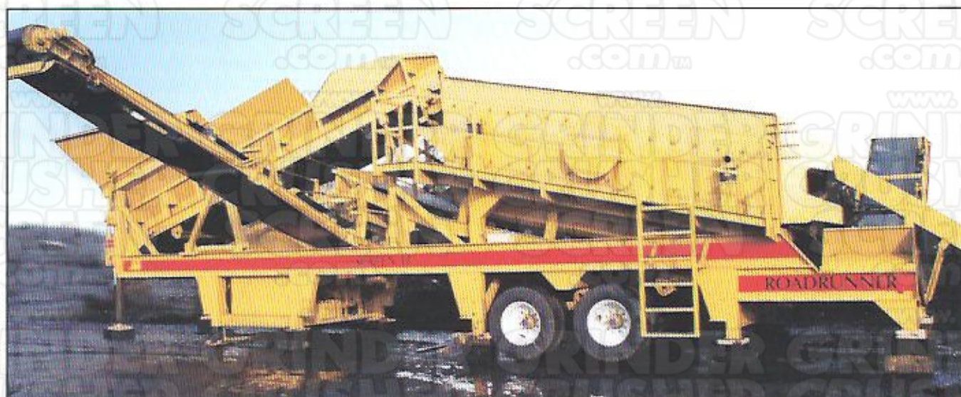
Highly portable – All hydraulic set up produces three different products