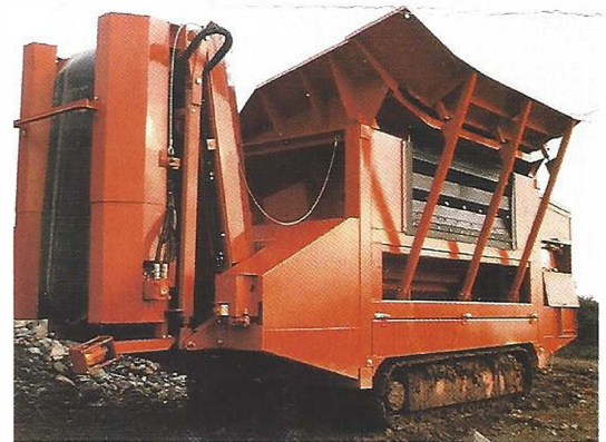
EZ-SCREEN 2000T shown with main conveyor folded

*Machine pictured with optional equipment