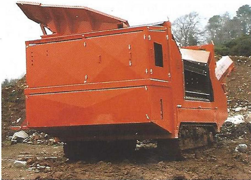
EZ-SCREEN 2000T shown without middle product conveyor