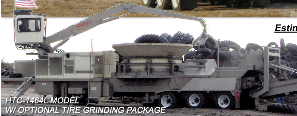
HTC-1464L MODEL W/ OPTIONAL TIRE GRINDING PACKAGE