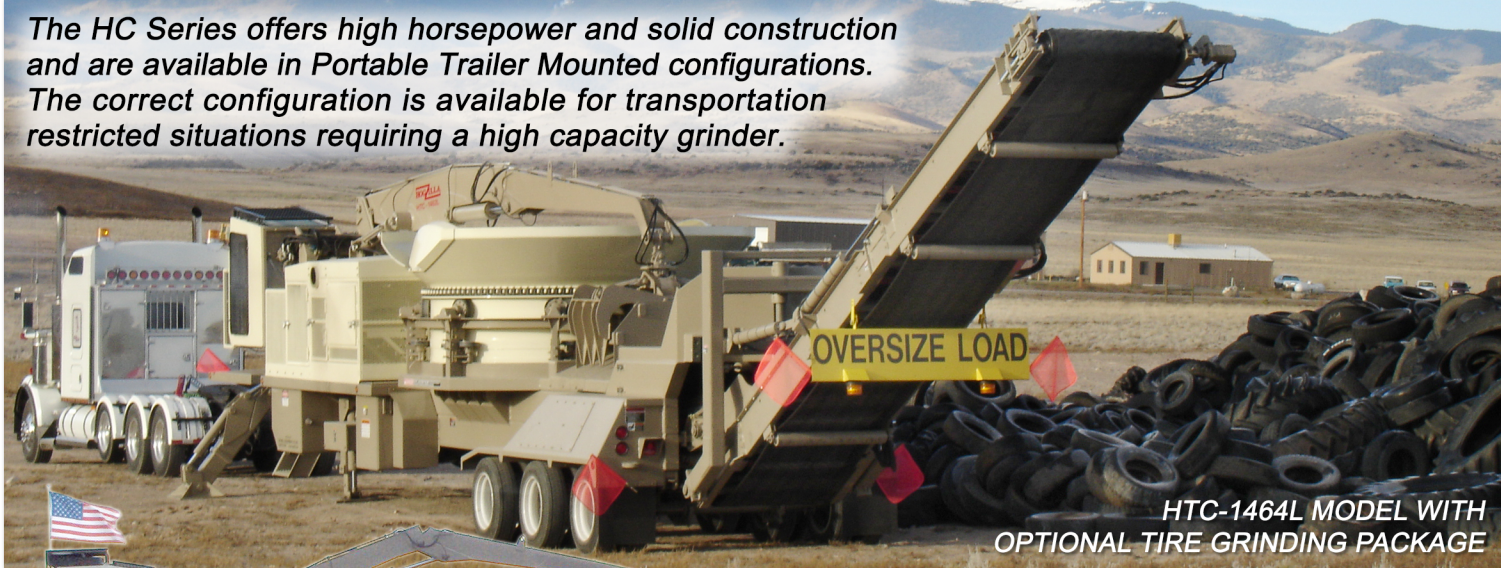
HTC-1464L MODEL WITH OPTIONAL TIRE GRINDING PACKAGE

The HC Series offers high horsepower and solid construction and are available in Portable Trailer Mounted configurations. The correct configuration is available for transportation restricted situations requiring a high capacity grinder.