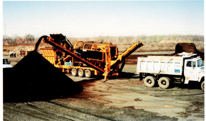
MODEL RHC 6-160 L

Wildcat Trommel Screens are available in many sizes for mobile or stationary applications with electric or hydraulic drives. Wildcat's aggressive drag link conveyor assures a constant flow of material. Self cleaning brushes keep screens open for maximum efficiency.