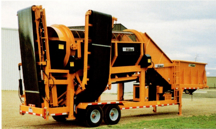
TOP SOIL • MULCH • COMPOST • WOOD CHIPS • YARD WASTE • LANDFILL MATERIAL MODEL RHC 5-140

Wildcat Trommel Screens are available in many sizes for mobile or stationary applications with electric or hydraulic drives. Wildcat's aggressive drag link conveyor assures a constant flow of material. Self cleaning brushes keep screens open for maximum efficiency.