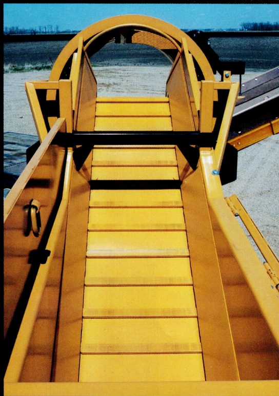
28" wide integral hopper and feed system prevents bridging with most materials