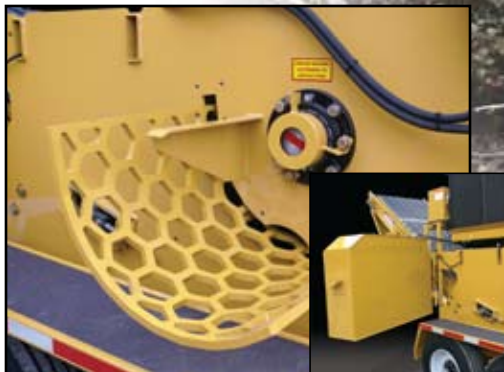
Swing-away fuel tank allows for easy screen changes in less than 10 minutes.