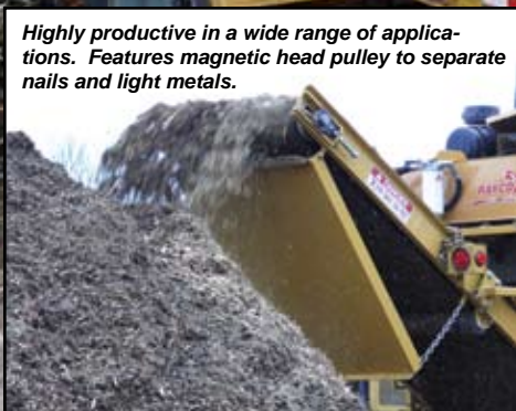
Highly productive in a wide range of applications. Features magnetic head pulley to separate nails and light metals.