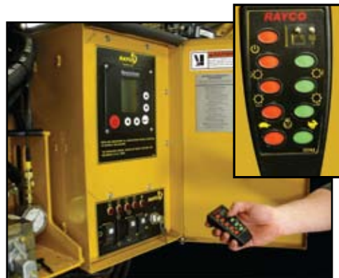
Radio remote control and digital instrument display