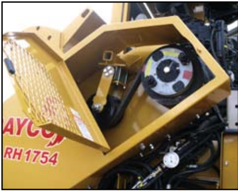
Torque limiter to minimize damage caused by high impacts.