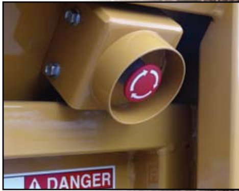
Emergency shutdown buttons located on all 4 corners of the machine.