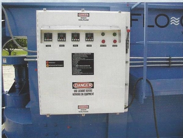
Frequency Drive Control Panel