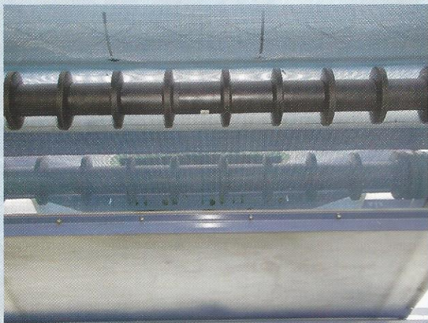
Mesh Conveyors Conserve Water