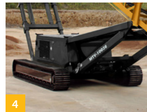
4 Provides remote maneuverability and enhances safety for moving freely to the best location.