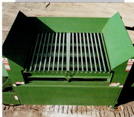
Double Deck Screen Built Tough for High Performance and Change of Decks