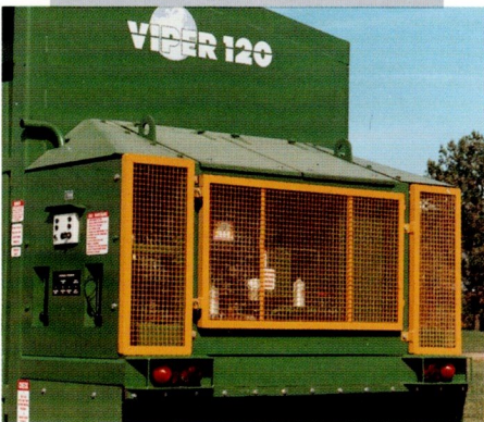
Easy Access Self Contained Power Pack with Early Warning Shut-Down