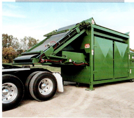
Hydraulic Leveling for Quick Set-Up