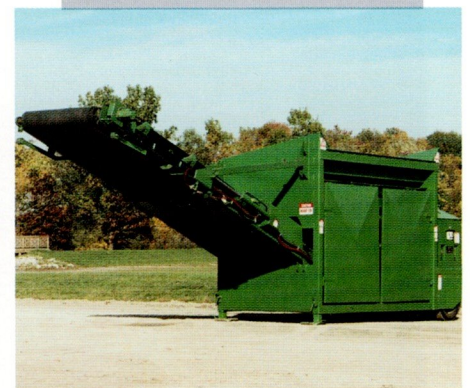
VIPERSIZER, the Answer to all Your Screening Problems