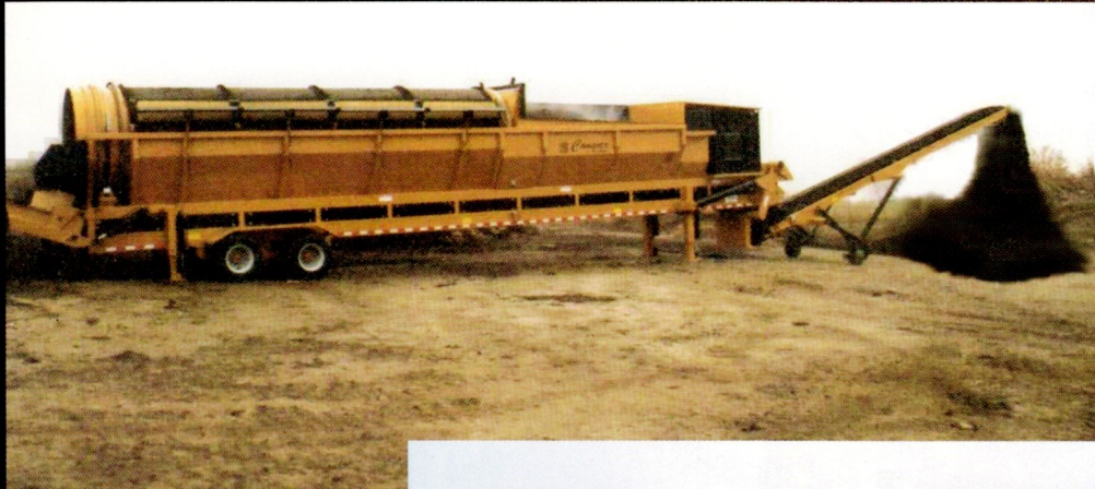
Shown with optional overs conveyor, which can lay flat for use as a picking conveyor.