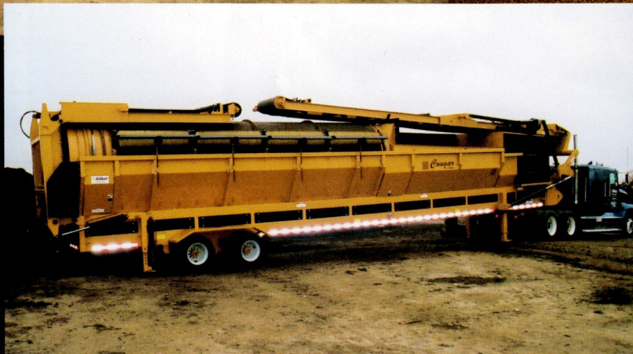
Easily transportable and sets up in 15 minutes. Attached conveyor makes loading trucks easy. Radial stockpiling conveyor will radial 180°.