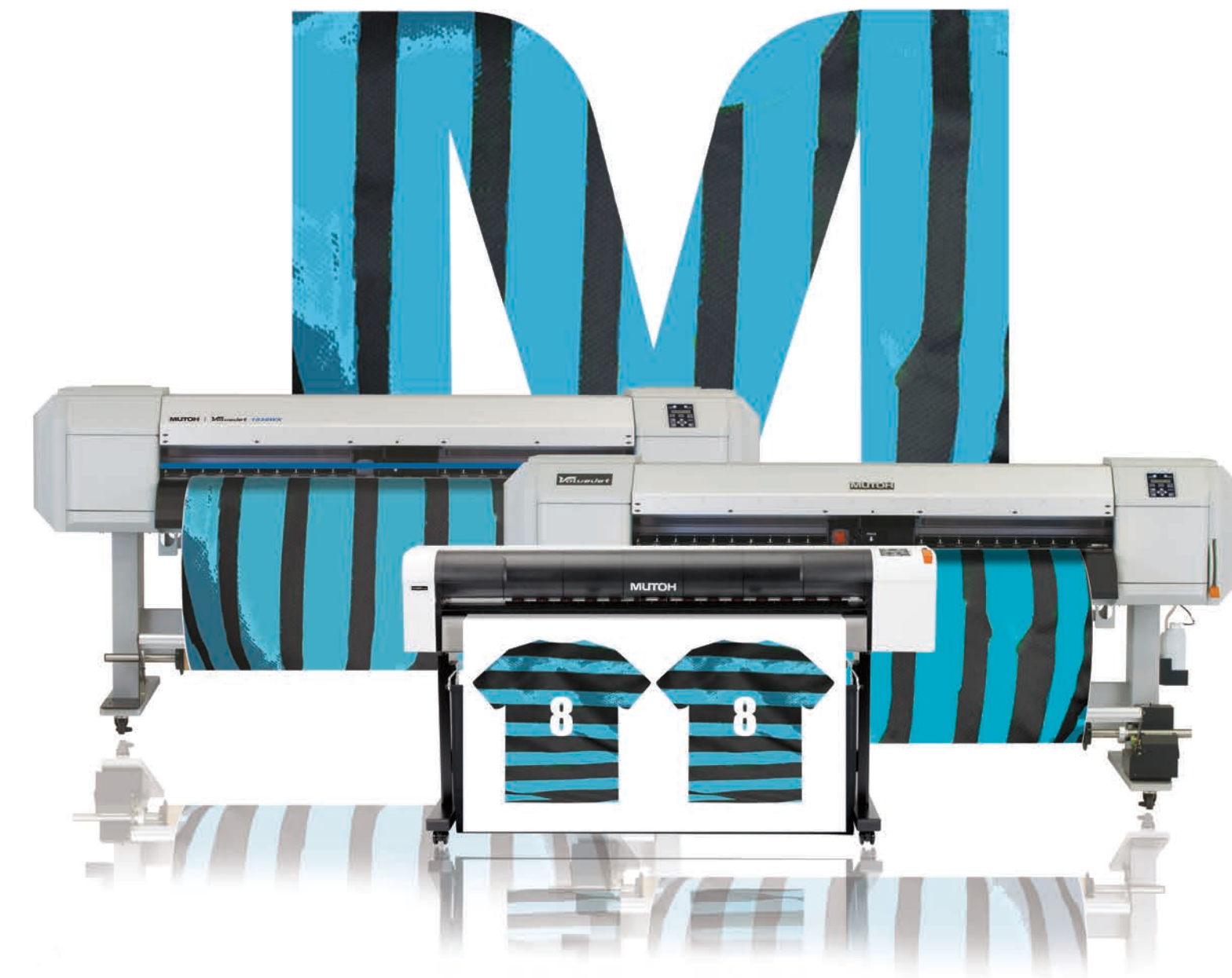
Dye-Sublimation Printer Family

For additional product information, to find an authorized Mutoh Reseller, schedule a demo or request a sample, visit www.MUTOH.com .