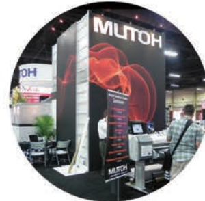
Trade Show Displays